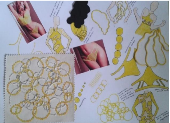
Figure 01 & 02 :Concept developments inspired by corset, brief and bra designs to form creative pattern cutting designs.