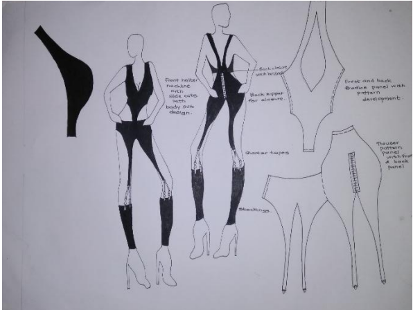
Figure 05,06,07&08: Design developments derived by corset, brief and bra designs inspired conceptual ideas to form outerwear silhouette ideas.