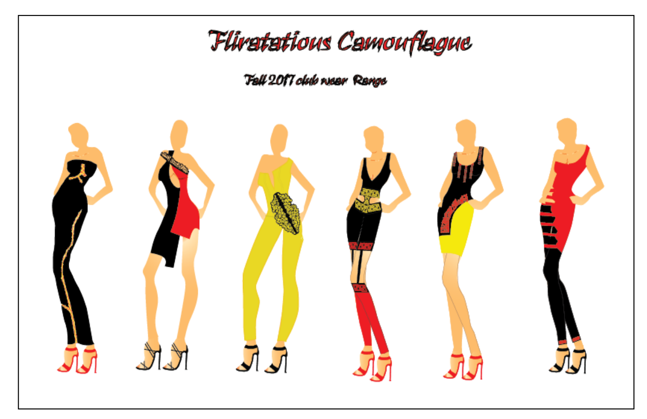
Figure 09: Finalized range- Front view

Finally the product development process was carried out to solve the problem of new innovative niche market category collection introduction with all the analyzed data. The outcomes of design developments are practically approached by experimenting creative pattern cutting with the use of mannequin and draping procedure to form the final toils. These toils are developed with the draw backs in the actual production process after finalizing the range plan of six outfits. These toils were developed with the drawbacks in the actual production process after finalizing the range plan of six outfits. Multiple methods such as draping, pivoting and folding were used in developing the pattern pieces for the collection. The pattern making process got even complicated as the fabrication was completely different to innerwear fabrication.