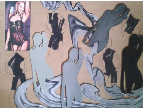
Figure 03 & 04 :Concept developments inspired by corset, brief and bra designs to form creative pattern cutting designs with the technique of gradation.