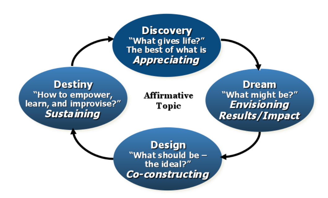
Figure 1. 4D Model of Appreciate Inquiry (Cooperrider & Godwin, 2012, p. 39)

In the implementation of AI as an approach in changing the landscape of social work development institutions, leadership and supervision are very crucial because the leaders' role is not only focused on problem-solving. Cojocaru (2010) encourages the use of appreciative supervision to bring about thoughtful changes in the organization, which the ASVP administration aspires to achieve.